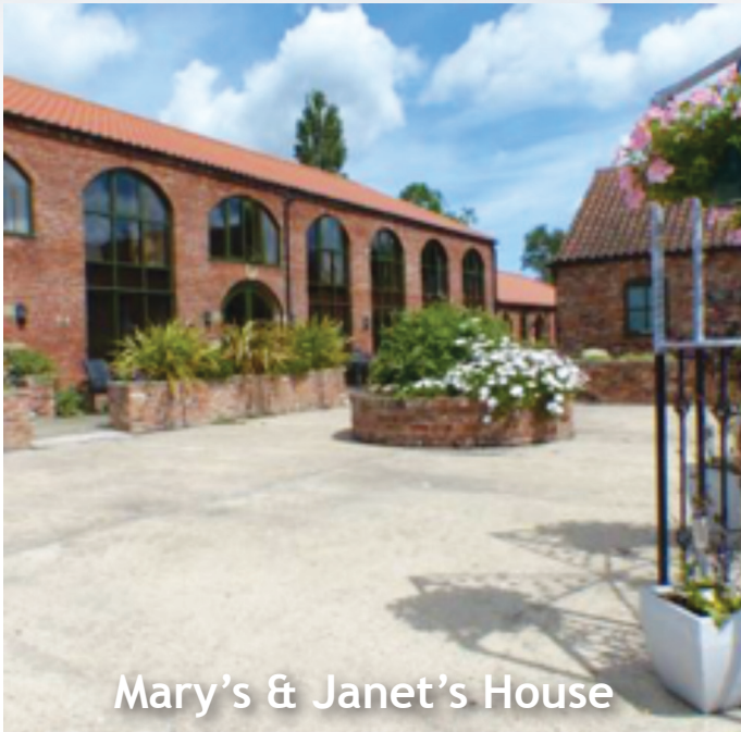
Mary's & Janet's House

Our 2 bedroomed House (sleeping up to 4)